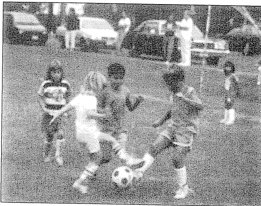
During the juvenile stage, children need to learn competition, cooperation, and compromise

The juvenile era begins with the appearance of the need for peers or playmates of equal status and ends when one finds a single chum to satisfy the need for intimacy. In the United States, the juvenile stage is roughly parallel to the first 3 years of