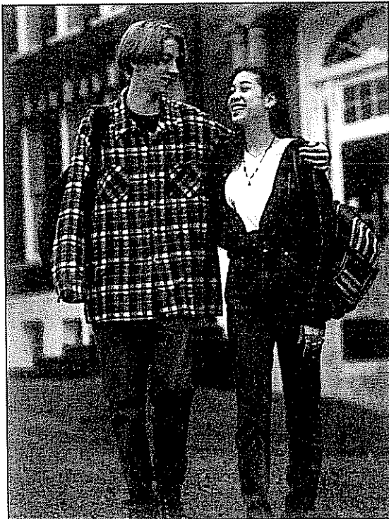
During late adolescence, young people feel both lust and intimacy toward one other person.

In Summary Table 8.2 summarizes the first six Sullivanian stages of development and shows the importance of interpersonal relationships at each stage.